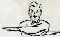
Penalty refused, incomplete pass, missed goal, etc.