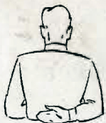
Illegal forward pass