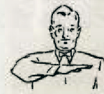
Illegal motion or formation at snap