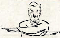
Penalty refused, incomplete pass, missed goal, etc.