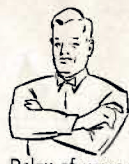
Delay of game or excess time out