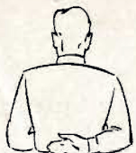
Illegal forward pass