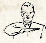
Illegal motion or formation at snap