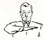
Illegal motion or formation at snap