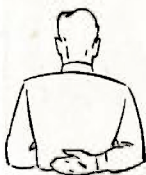
Illegal forward pass