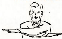
Penalty refused, incomplete pass, missed goal, etc.