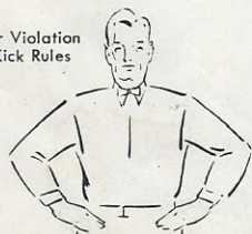
Off-side or Violation of Free-Kick Rules