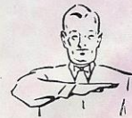
Illegal Motion or Formation at Snap