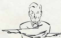
Penalty Refused, Incomplete Pass, Missed Goal, etc.