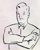
Delay of Game or Excess Time Out