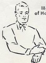
Illegal use of Hands or Arms